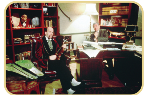
Top: Clocktower Bottom: Conan Doyle's Study